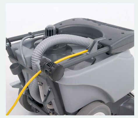
The handle is adjustable for easy storage and ergonomic operation (AX 410)