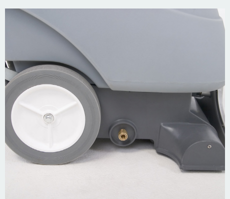
Large, non-marking wheels for easy operation and transport (AX 410)