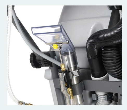
On-board accessories on make it easy to clean seat and wall coverings and hard to-reach spots (AX410)